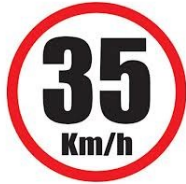
Exceeding Speed Limit

Maximum speed in container yard and wharf area