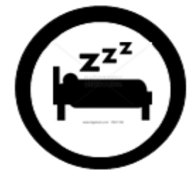
Sleeping At Point Of Work