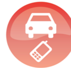
Using Personal Electronic Device While Driving