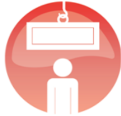
Working Under Suspended Load