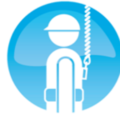
Working At Height Without Harness