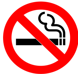
Smoking At "Non-Smoking" Area