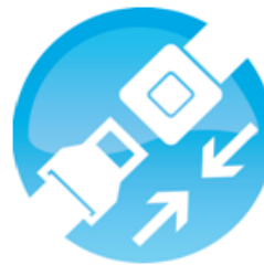
Not Wearing Seat Belt